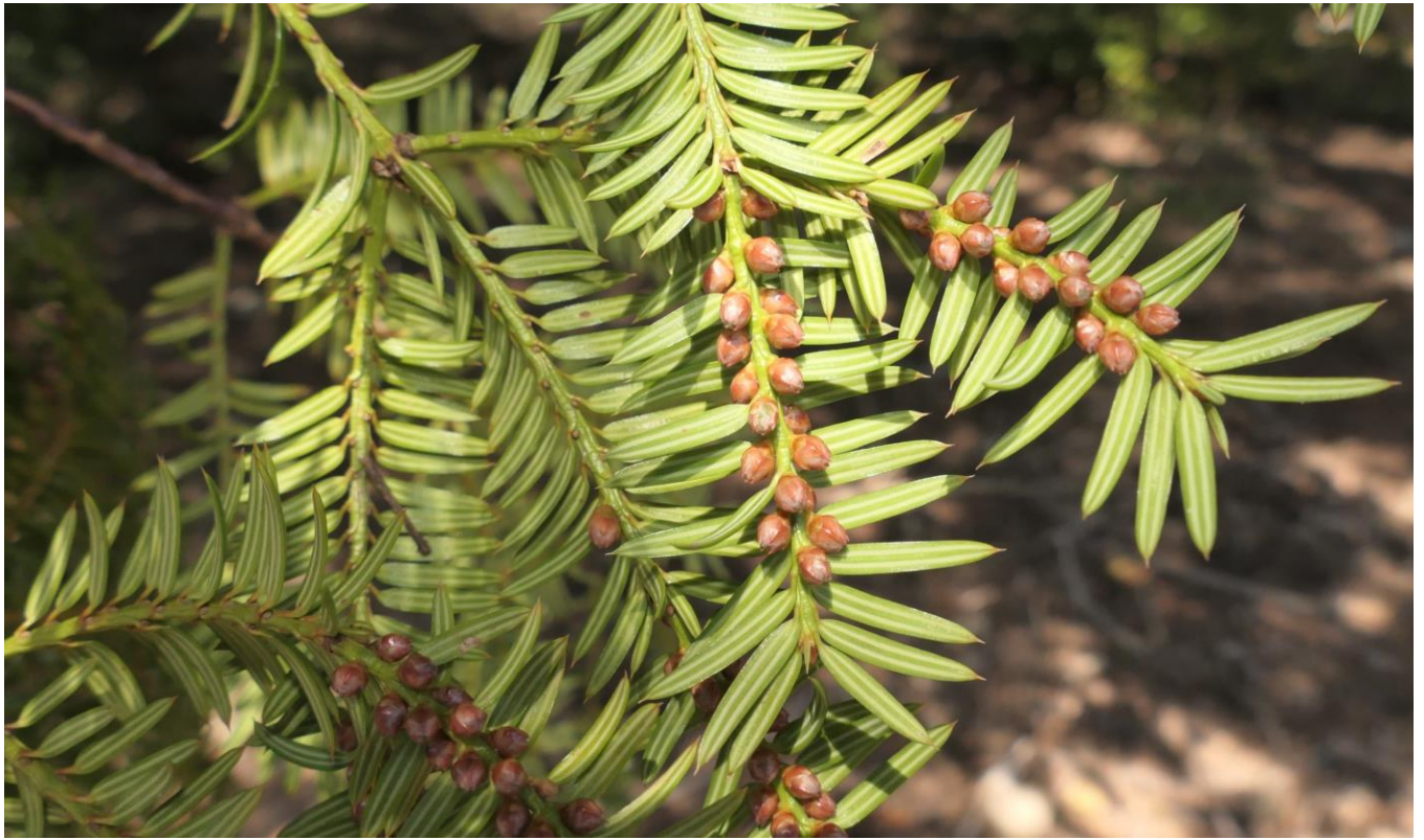
Japan / Kyoto - Kyomizu Dera Tempel 2024